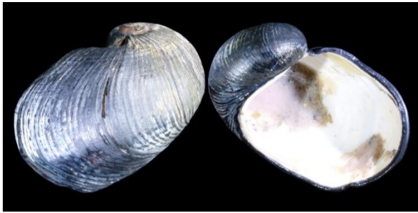
3. A typical coiled “limpet:” shell of Chrysomallon squamiferum (Neomphalida, Peltospiridae) (L 35 mm), from SW Indian Ocean (MZSP 168467), dorsal and apertural views. There is no columellar muscle, but so a horseshoe-shaped shell muscle (see Fig 1F: sm).

The re-spiralization process can progress to the point where the shell fully coils, resulting in a form that externally resembles a typical snail. A prime example of this is Chrysomallon squamiferum (Figs. 1F, 3), along with, to a lesser extent, other members of the family Peltospiridae (Fig. 2G). Peltospirids exhibit shell forms that lie on the borderline between beak shells and fully coiled “limpets.”