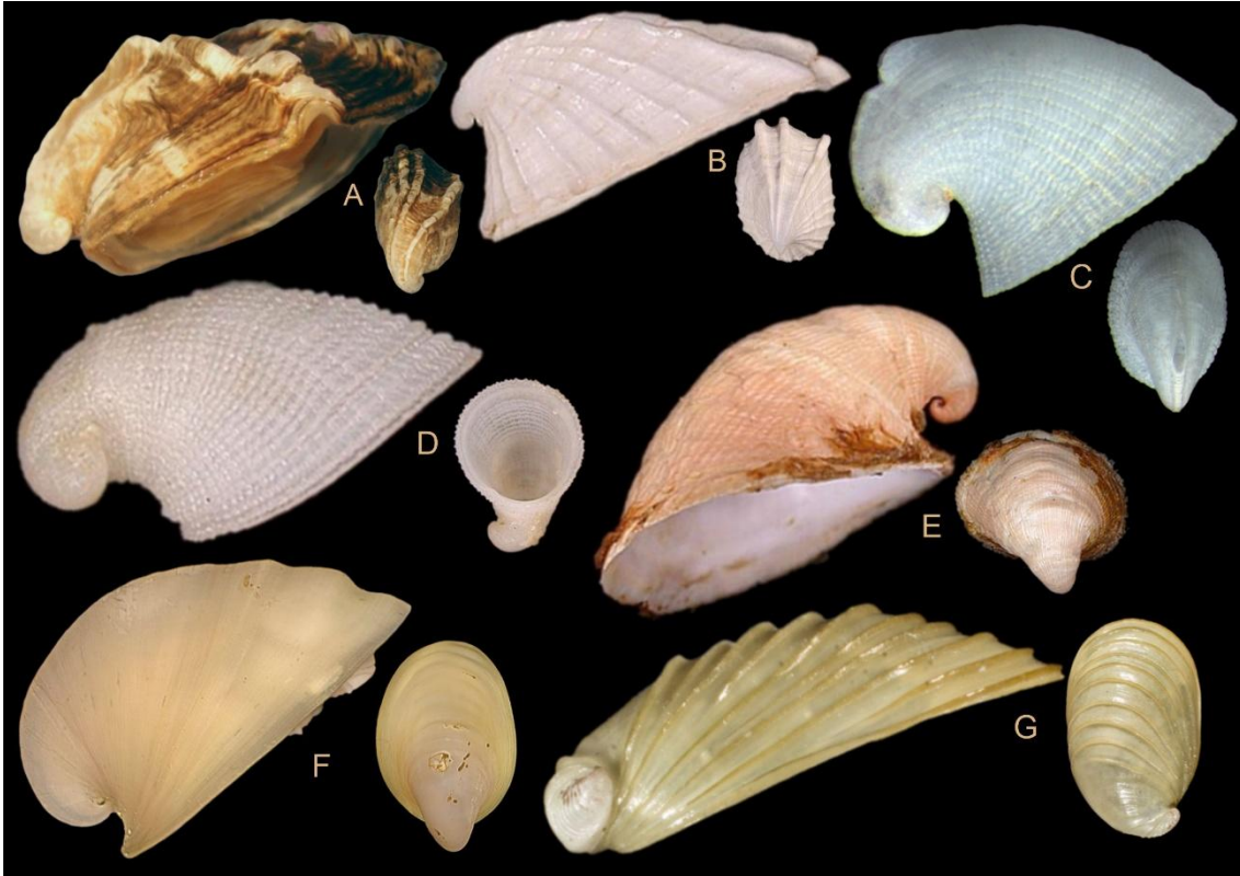
2. Examples of taxa possessing beak shells. A , Cyclothyca pacei FMNH 301979 Florida (L 13 mm) (from Simone & Bieler, submit.); B , Amathina tricarinata (Femorale) Japan (27 mm) (both Heterobranchia); C , Cranopsis alaris MNHN 25305, Brazil (3 mm) (from Simone & Cunha, 2014) (Vetigastropoda); D , Hipponix incurvus (Femorale) Brazil (6 mm); E , Capulus ungaricus (Femorale) Greece (28 mm) (both Caenogastropoda); F , Lepetodrilus marianae NSMT-Mo 79483 (8 mm) (from SOSA et al., 2024) (Lepetellida); G , Peltospira delicata MNHN 31388, W Pacific (5 mm) (Neomphalida).

Although there is no distinct boundary between beak shells and true limpets, typical beak shells are characterized by a beak-like hump at the apex, which shelters part of the visceral mass (Fig. 1E). When the shell apex is coiled, the visceral portion housed within it also forms corresponding coils.