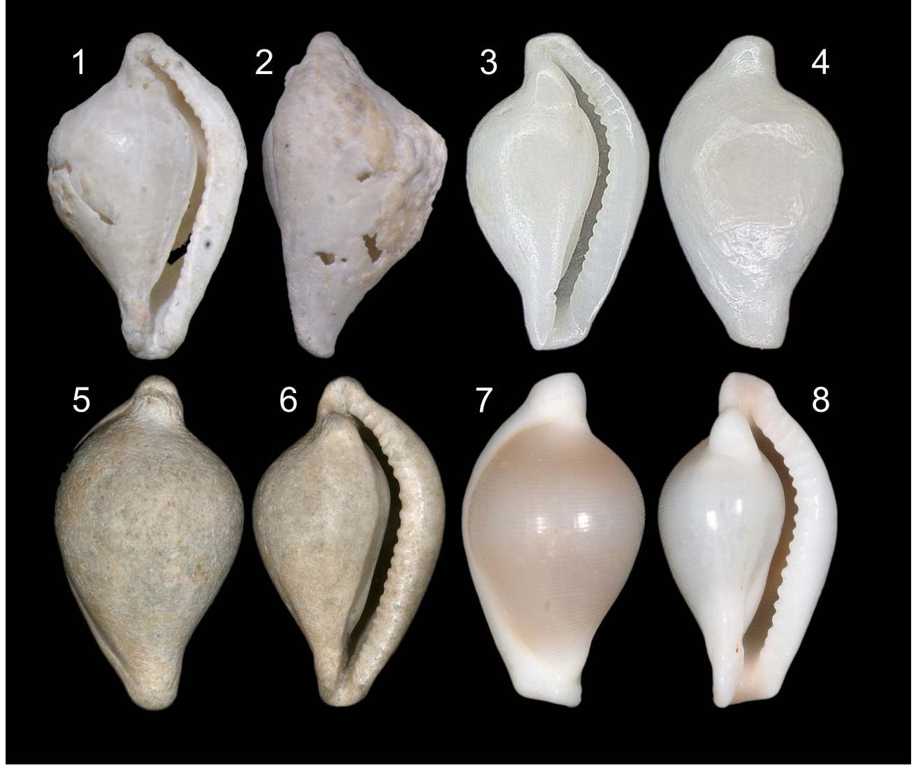
Figs. 1-8, Pseudosimnia vanhyningi; 1-4, specimens from Canopus Bank, Ceará, Brazil; 1-2, MZSP 69851, apertural and right views, length = 15.4 mm; 3-4, Vanin collection, apertural and dorsal views, length = 11 mm; 5-6, Holotype of Pseudosimnia sphoni, USNM 418078, dorsal and apertural views, length = 13.8 mm; 7-8, Holotype of Pseudosimnia pyrifera, USNM 460466, dorsal and apertural views, length = 9.5 mm.